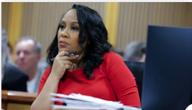
Judge Grants Trump Appeal on Willis' Role in Georgia Election Case