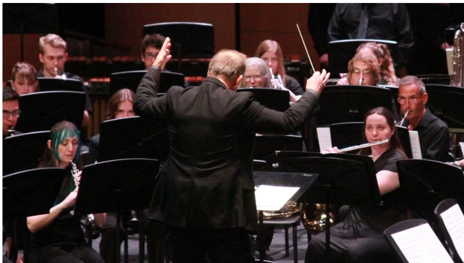
Mesa Community College Music Ensemble Wows with 'Odds & Ends' Performance

Mesa Community College's Performing Arts Center became the epicenter of musical talent on February 27, as the college's Community Band, Concert Band, and Community Orchestra joined forces to present a concert titled "Odds & Ends." This performance not only showcased the diverse musical talents of MCC students and Valley musicians but also marked the transformation of a former Harkins Theater into a thriving venue for one of the nation's largest community college music departments.