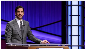
Aaron Rodgers Nearly Landed 'Jeopardy!' Role, Reveals Show's Ex-Producer Mike Richards